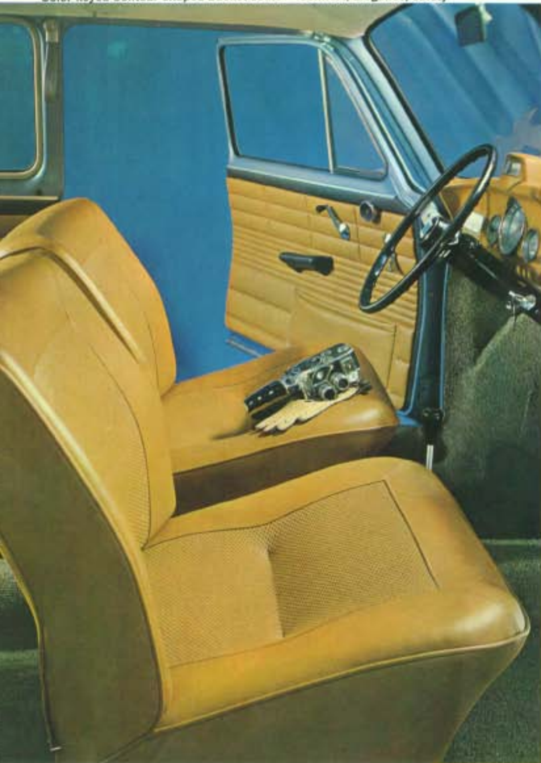
Color-keyed Contour-shaped Bucket Seats — Comfort, Elegance, Safety