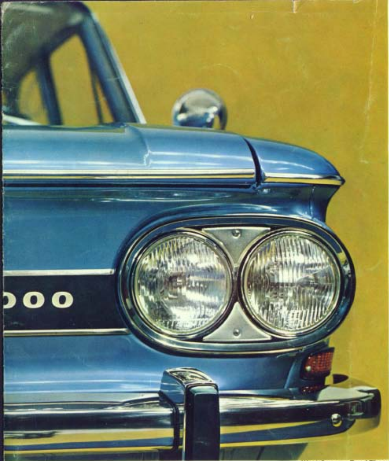
West German Road Tiger