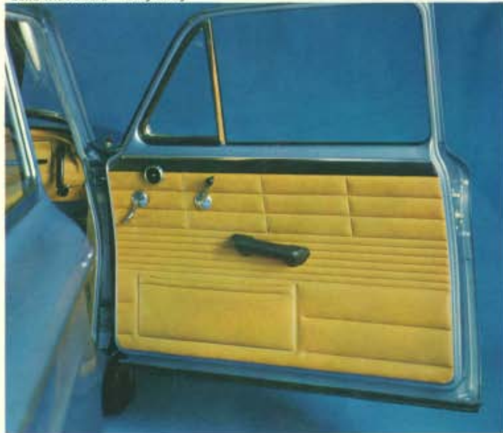
Solid Wide Doors — Easy Entry